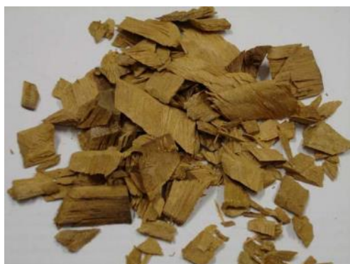
Artocarpus lakoocha heart wood

The oxyresveratrol is a major compound found in heart wood of Ma-Haad. Oxyresveratrol exhibits potent inhibitory effect with an IC 50 value of 1.2 \mu M on tyrosinase activity, which is 32 times a more potent inhibition than kojic acid (IC 50 40.1 \mu M). Oxyresveratrol has a stronger inhibition of tyrosinase on melanoma cell line than kojic acid. Oxyresveratrol offers approximately 150 times more inhibitive potency than resveratrol making the compound ideal for use as a de-pigmenting agent in the use of cosmetic skin-whitening products and medical agents for hyperpigmentation disorders, and does not exhibit any of the side-effects associated with the current market's 'melasma drug' (Hydroquinone).